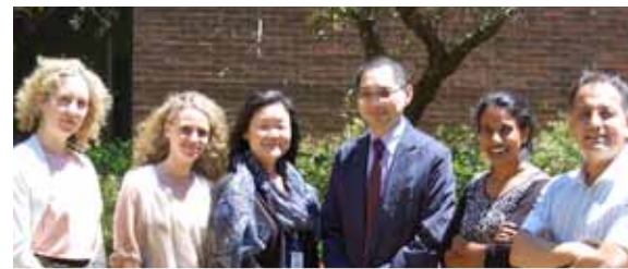
Memory Clinic Team

a health care professional trained to use standardized neuropsychological tests to identify areas of memory and other cognitive impairment and suggest compensatory strategies.